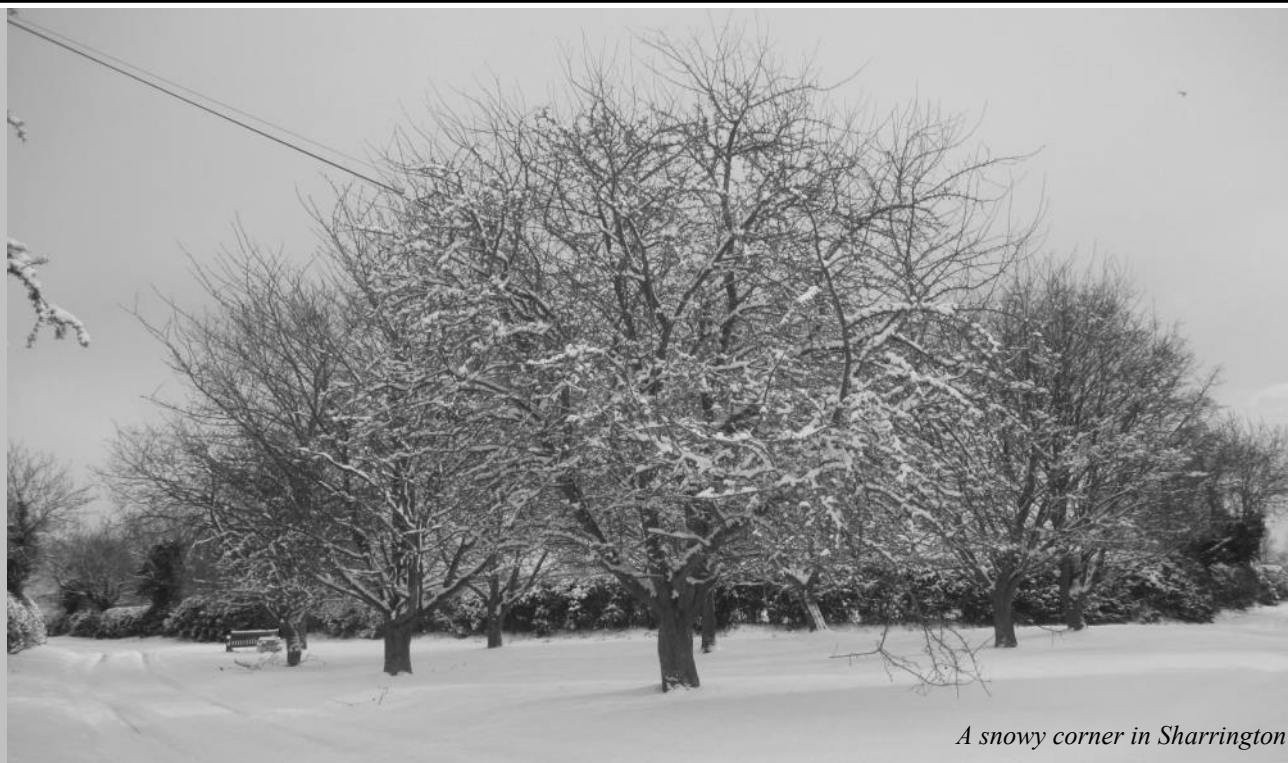
A snowy corner in Sharrington